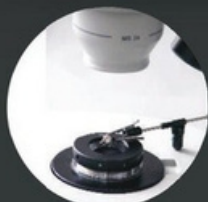
Gems - Inspection Accessories